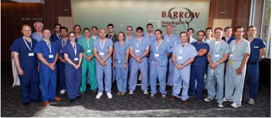
Fellowship Class of 2010